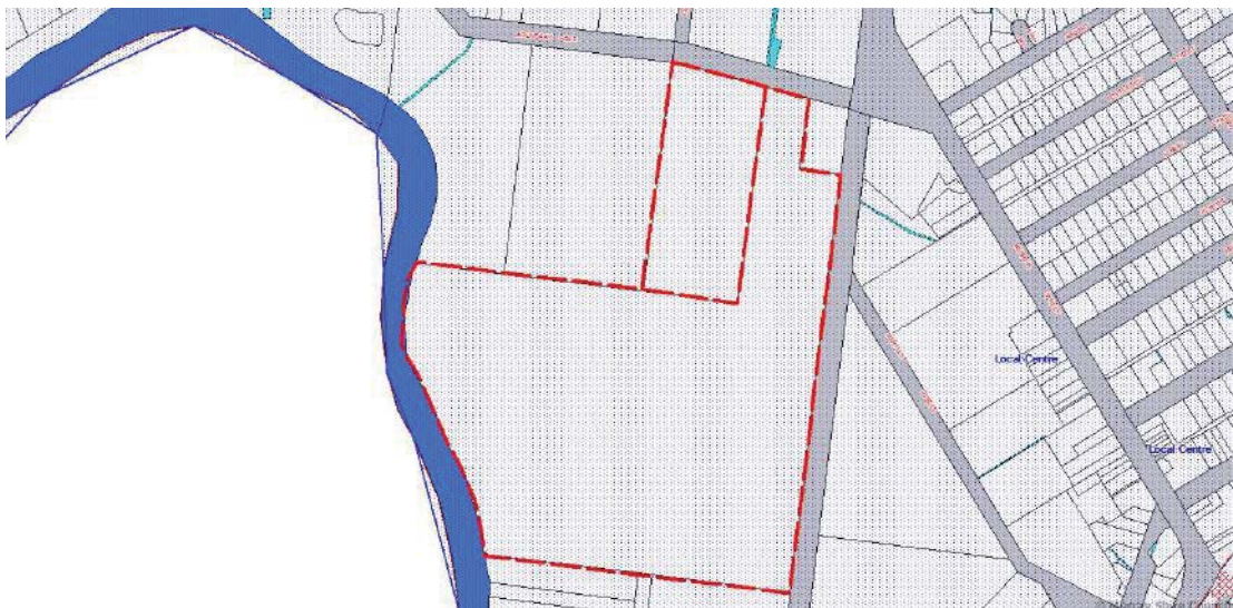
Figure 3 – Murray REP2 mapping coverage

Both allotments are covered in their entirety – See Figure 3