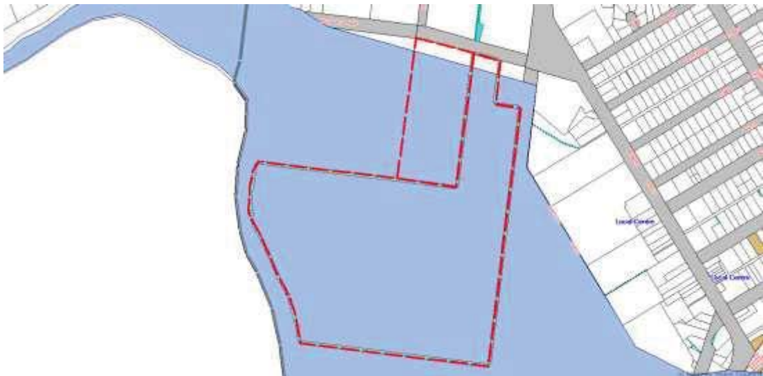
Figure7 – Flood prone land mapping

The subject lots are covered by Council's Murray LEP 2011 Flood Planning mapping. The site of the proposed additional permitted use is not covered. See Figure 7.