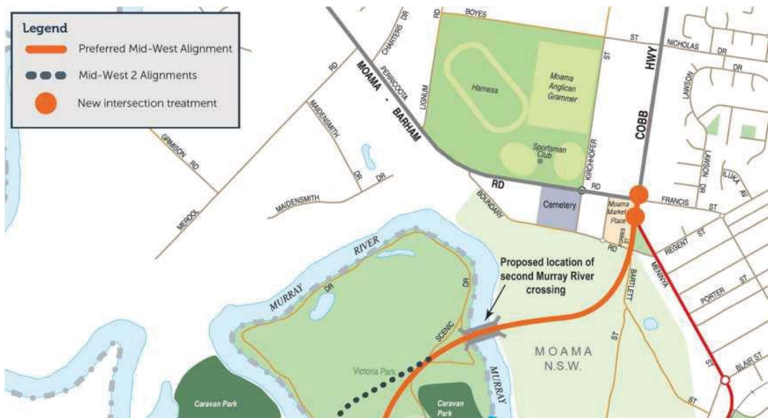
Figure 9 – Proposed “Preferred Mid-West Alignment”

The proposal site is located close to existing services and facilities including retail facilities and public transport networks. It should also be noted that the site is in close proximity to the “Preferred Mid-West Alignment” for the proposed second Moama-Echuca Bridge Crossing. See Figure 9 provided in current VicRoads documentation for proposed alignment. See Figure 10 for location of the subject.