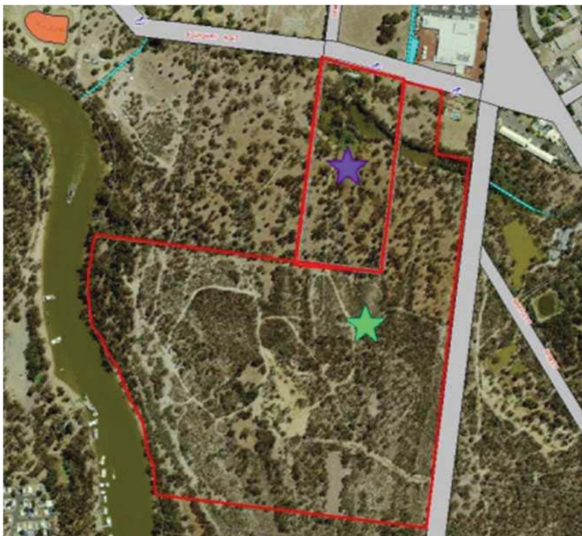
Figure 1: Subject Land –Lot 26 DP 751152 and Lot 2 DP 509954

The land subject of the planning proposal is the northern section of Lot 26 DP 751152 and Lot 2 DP 509954, not mapped as Flood Prone Land under the Murray LEP 2011. Lot 26 DP 751152 and Lot 2 DP 509954 in their entirety are zoned E3 Environmental Management and are affected by a 120 hectare minimum lot size. Aerial photography of the subject lots is set out below, with Lot 26 indicated by the purple star and Lot 2 indicated by the green star in Figure 1. Figure 2 set out below has been extracted from the Proponent's Planning Proposal document, with the red outline in this Figure indicating the area sought to be affected by the Schedule 1 inclusion, under this Planning Proposal.