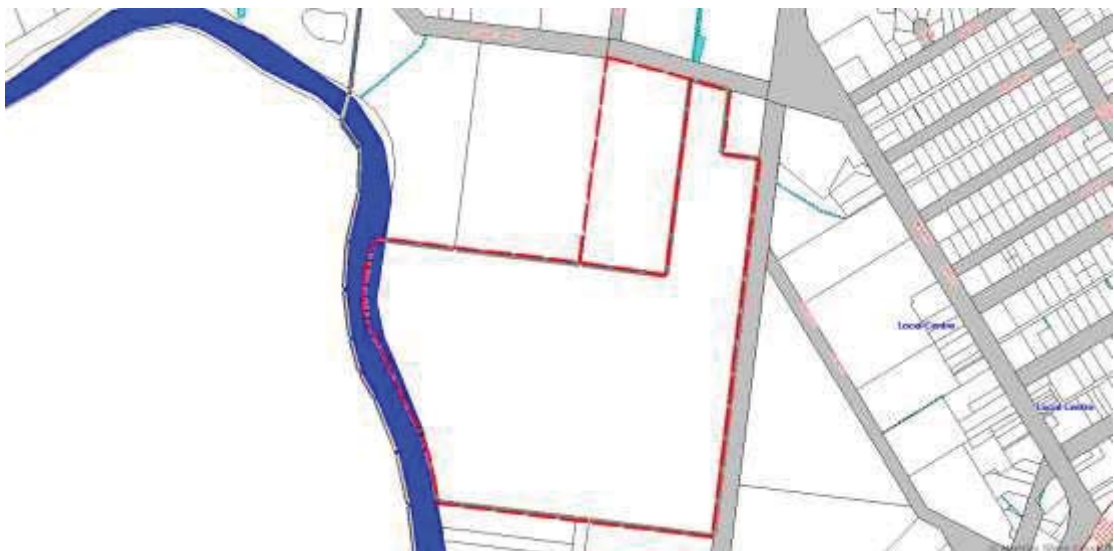
Figure 5 – ‘Key Fish Habitat mapping

Part of Lot 2 DP 509954 is covered by Key Fish Habitat mapping. However, the area sought to be affected by Planning Proposal is not covered by such mapping.