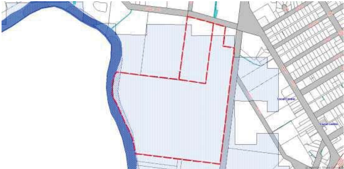
Figure 4 – ‘Watercourses’(Floodplain wetlands mapping)