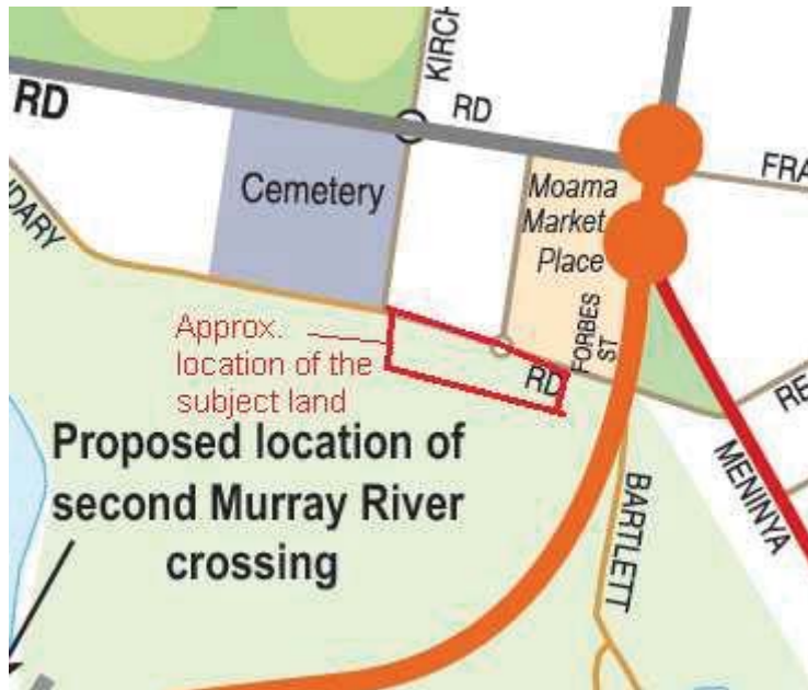
Figure 10 – Approximate location of subject site in context with “Preferred Mid-West Alignment”