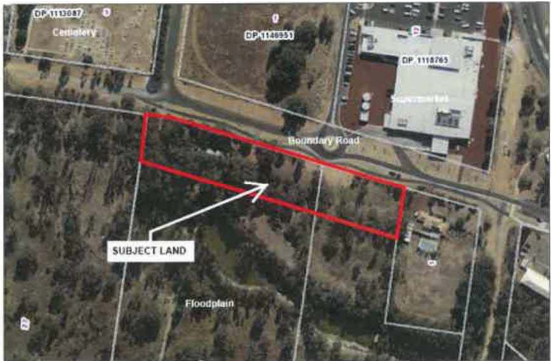
Figure 2 – Area of the subject lots affected by Proposal

The subject lots are covered the following Council mapping: