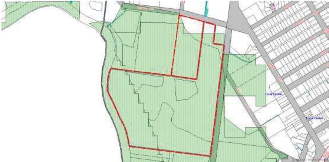
Figure 6 – Terrestrial Biodiversity mapping